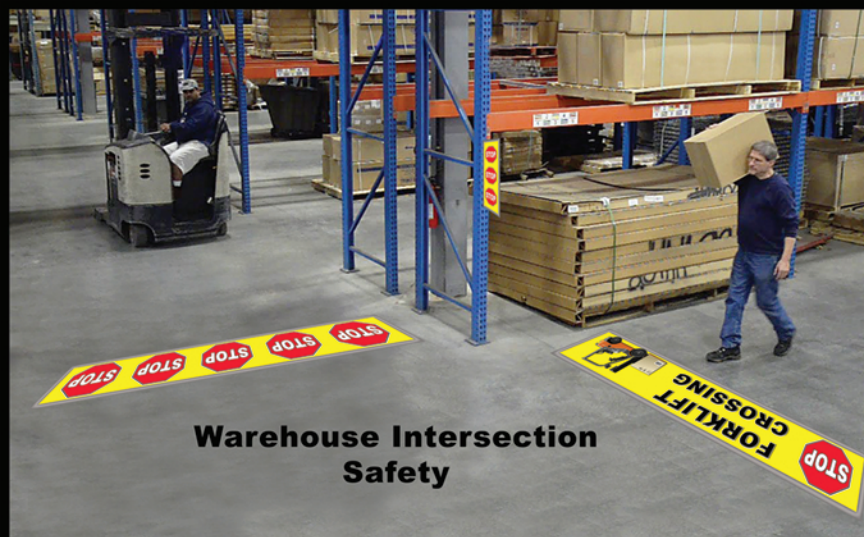
Warehouse Intersection Safety